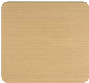
Silver Elm UC3006