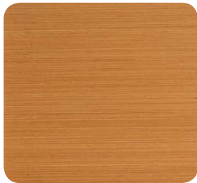
Coastal VG Fir UC3000