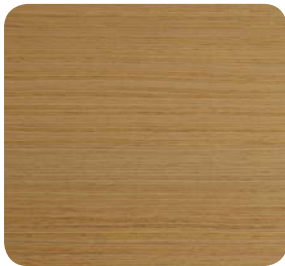
European Oak UC3012