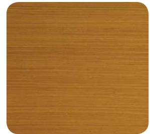
Teak Quartered UC3013