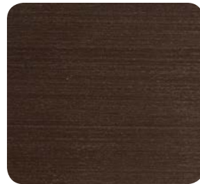
Platinum Wenge UC3003