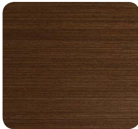
Wenge Quartered UC3009