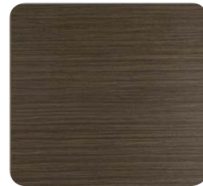
Charcoal Ash UC3004