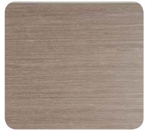
Frosted Oak UC3001