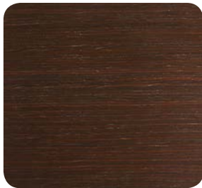
Claro Walnut UC3007