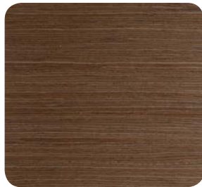
Walnut Quartered UC3002