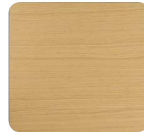
White Oak Rift UC3008