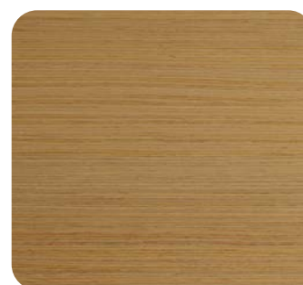
European Oak UC3012