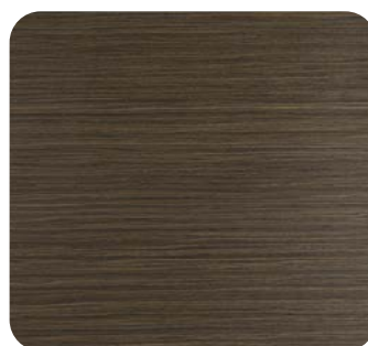
Charcoal Ash UC3004