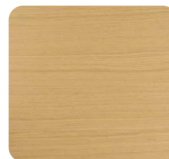
White Oak Rift UC3008