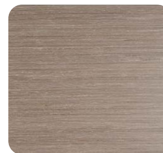
Frosted Oak UC3001