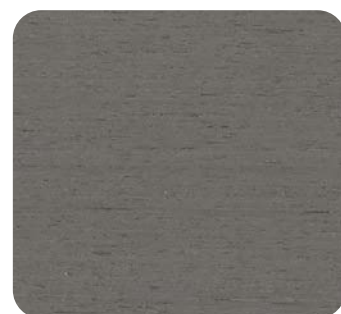
Gray Obechie UC3015