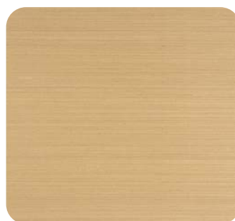
Silver Elm UC3006