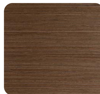
Walnut Quartered UC3002