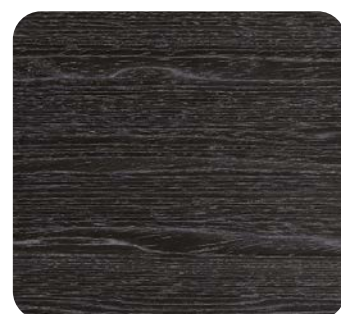
Black Oak UC3011