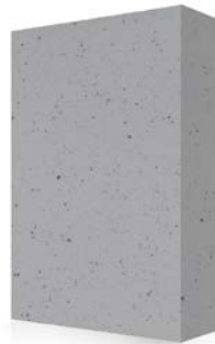
Shark Skin 7556