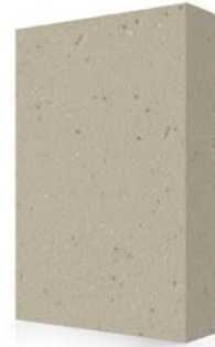
Vintage Concrete 7857