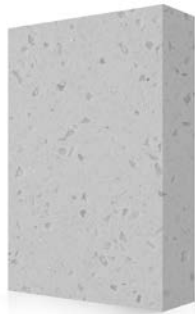
Dove Shimmer 7856