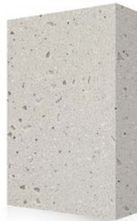
New Concrete 7842