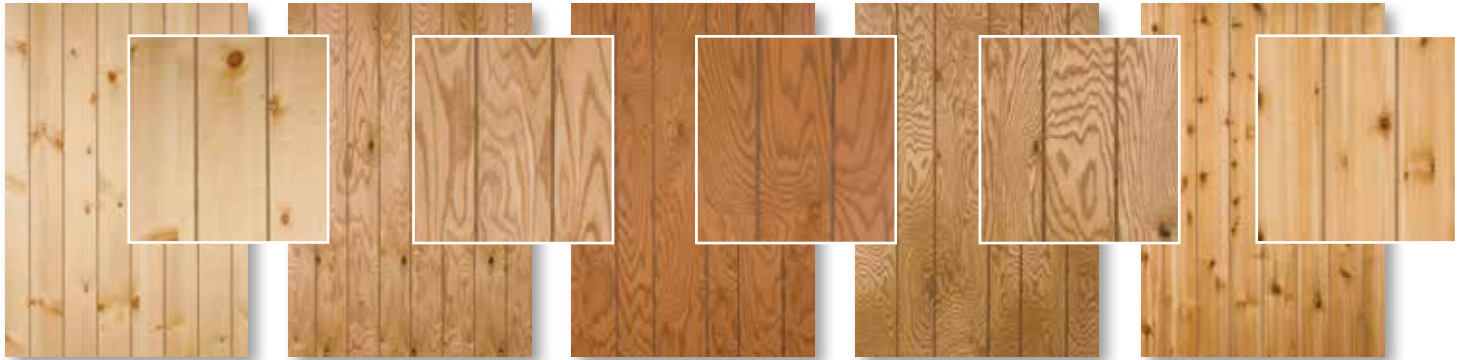
Evergreen 7/16" V-Groove 6" OC

Timber Ridge real wood panels, measuring a stout 7/16" thick, either have a V-groove on 6" centers or a channel groove in the pattern listed below.