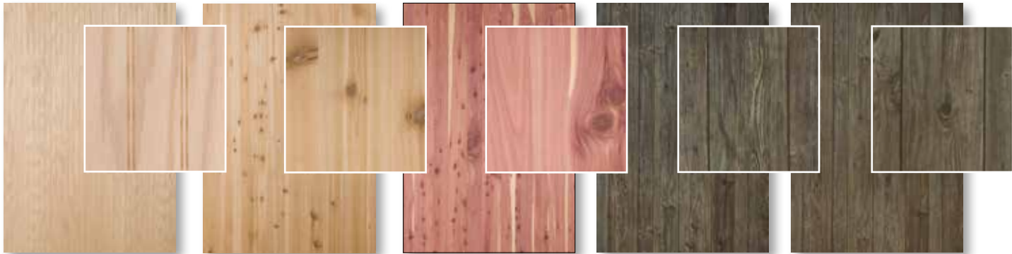
Oak Unfinished 5.0 mm Beaded 1-1/2" OC