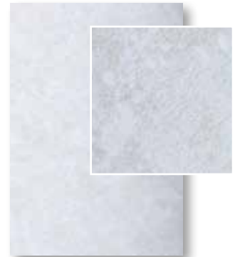
Summer Cloud* 1/8" MDF substrate Paper Overlay

Factory applied paper overlays offer an attractive, economical paneling option. Murphy uses various backing substrates that provide the look of real wood quality at a lower cost.