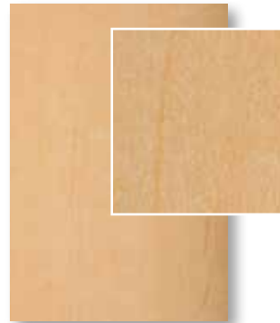
Honey Maple* 1/8" MDF substrate Paper Overlay