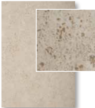
Beige Stone* 1/8" MDF substrate Paper Overlay