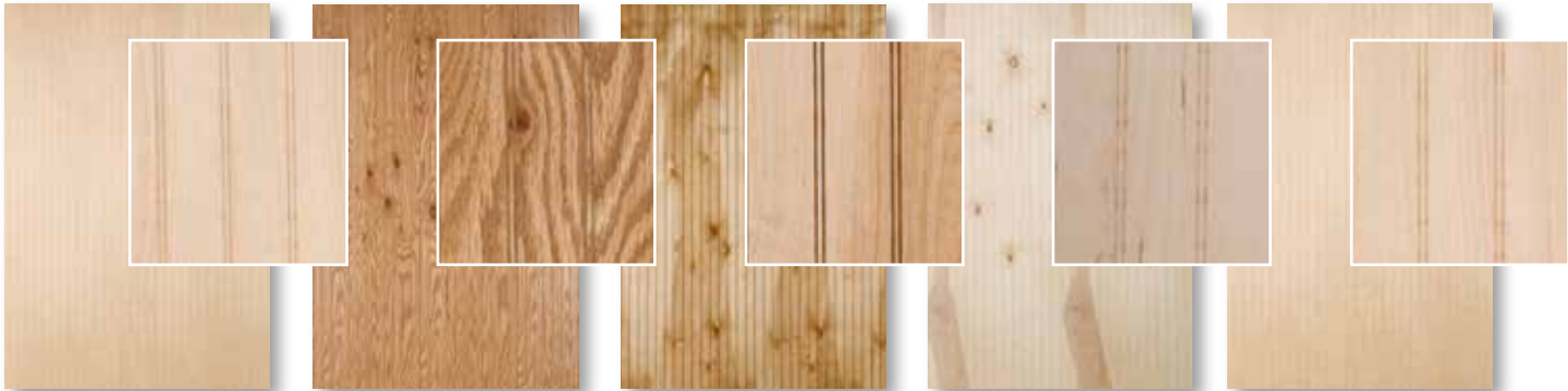
Unfinished White Birch 5/32" Beaded 1-1/2" OC

Murphy's most popular real wood veneer paneling features the classic look of bead board planks without the expense. The easy-to-install, 4 X 8 panels are perfect for wall paneling, wainscoting, cabinet doors and cabinet backers. The beads are 1-1/2" OC.