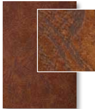
Coffee Bean Leather* 1/8" MDF substrate Paper Overlay