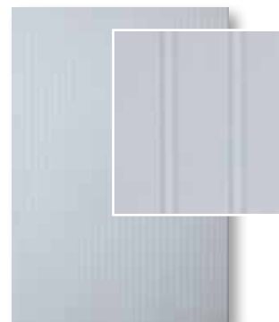
Primed 5.2mm MDF substrate

Murphy Premium Beaded MDF uses a proprietary bead and is available in the following sizes: